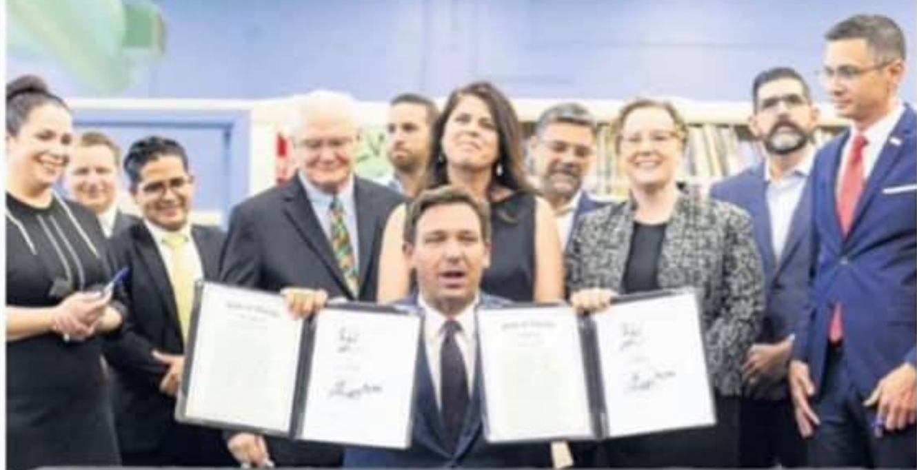
West Miami Middle School Eco-Tec Magnet